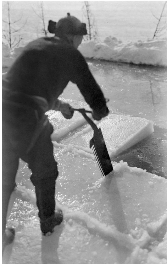
Fig. 2. Ice cutting 1920s-1930s.