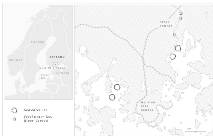
Fig 1. The main locations of ice harvesting in the city of Helsinki, Finland.

The acquisition of ice was concentrated in a time period typically in February-March, when ice formation had reached a minimum thickness of 25–30 cm. Using the applications of individual harvesters as a guide, the city authorities indicated designated spots to be used as ice fields. Men with their long, specially designed saws entered a short, but intensive period of cutting ice. During years with advantageous weather conditions, one or even two more consecutive harvests could be made later in spring (W.-I., 1933).