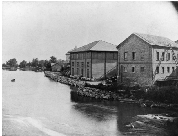
Fig 5. The (on the left) ice house of the Hartwall company in 1900. The blind walls enabled maximum insulation to preserve the cold over time. The building does not exist anymore.