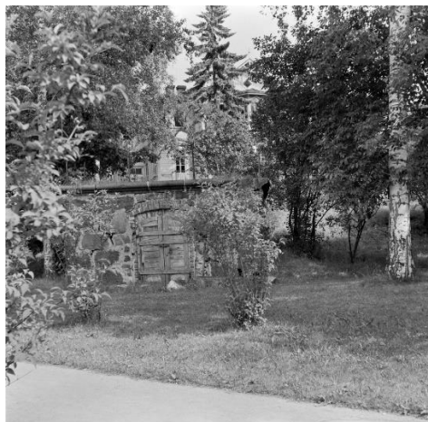
Fig. 6 Former ice cellar of an urban villa, Helsinki 1963.