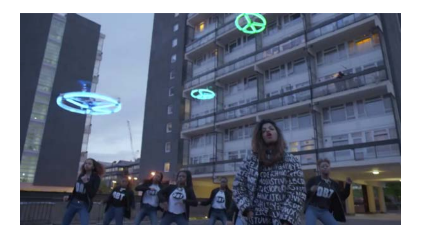
Fig.2 Double Bubble Trouble (2014), M.I.A. & The Partysquad (fair use)

amass a set of internet memes and viral phenomena – it diagnoses a weird future immanent to the present and exposes what is at stake. Interspersed between the articles that make up this edition, we include some short speculative provocations that seek to do something similar, together with some perspectives on drone culture that de-westernize such diagnoses.<sup>2</sup>